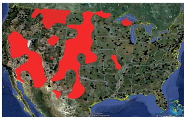
Fig. 1 AirNow surface \text{PM}_{2.5} observations (black dots). The red areas are gaps in the data. These results from a combination of missing ground sites and bright ground surfaces that preclude accurate retrievals of aerosol properties from satellite observations.

PACE measurements will also have direct applications in near-real-time monitoring of air pollution. AQI provide the public with easy access to national ambient air quality information, namely real-time and forecasted air quality conditions. Integration of future satellite data (e.g., TEMPO and PACE) with these databases will continue these forecasts, enabling public awareness of potentially deleterious air quality events that can adversely affect susceptible individuals. Figure 1 shows that, although substantial progress has been made to use satellite data to predict air quality for most of the country, a large area (shown in red) still lacks coverage. There are substantial health benefits for people who take protective action to avoid exposure to high outdoor \text{PM}_{2.5} concentrations. Shaded red areas in Fig. 1 are regions for which AirNow provides no air quality information, because the prediction standard error is > \sim 5 \mu\text{g}/\text{m}^3 (the U.S. National Ambient Air Quality \text{PM}_{2.5} Standard is 35 \mu\text{g}/\text{m}^3 for 24 h average).