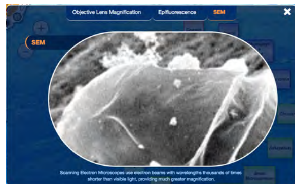
A view from a Scanning Electron Microscope.